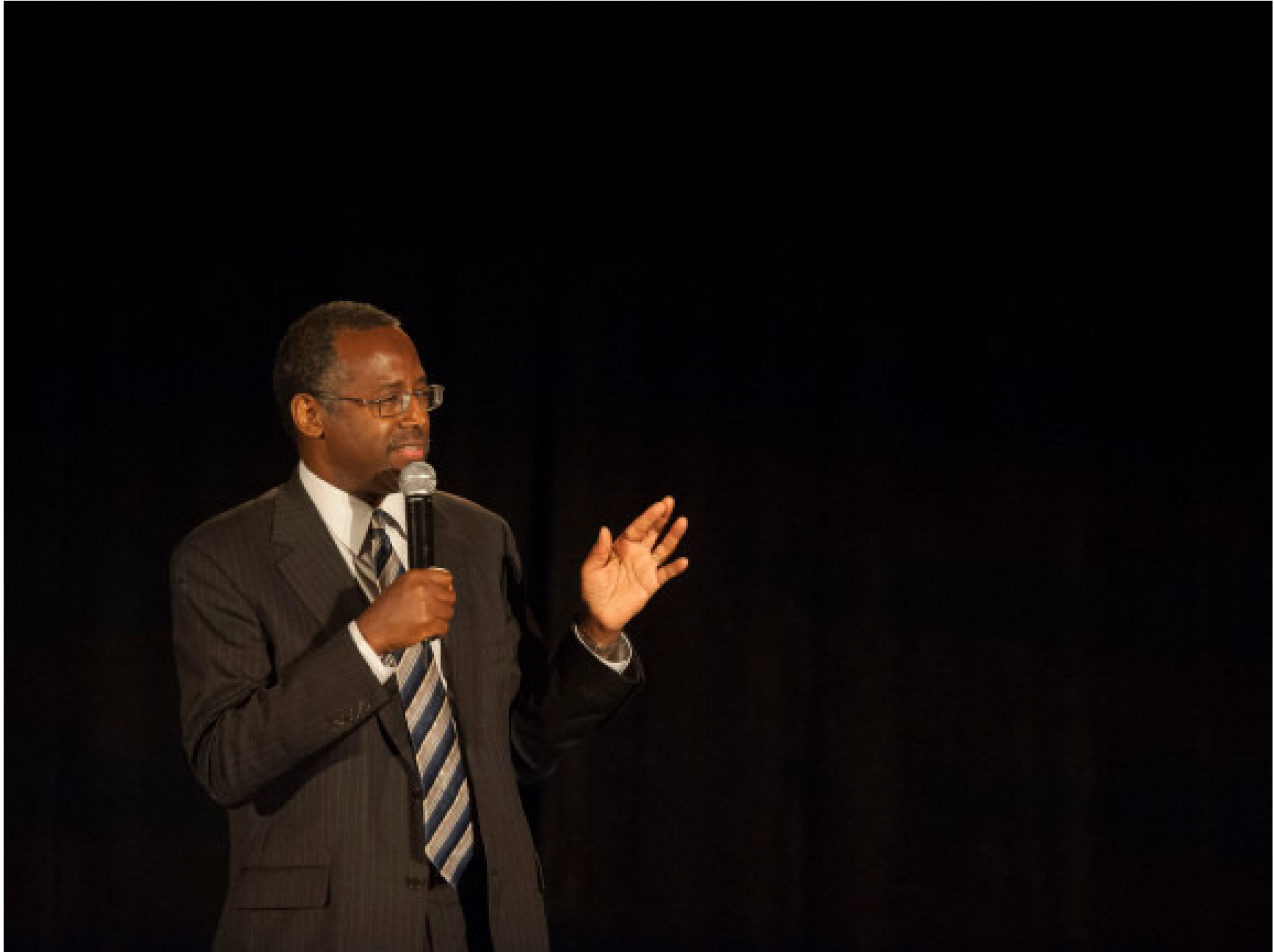
Dr. Ben Carson gives the keynote speech at the Wake Up America gala event on Sept. 5 at the Westin Kierland Resort in Scottsdale, Arizona.